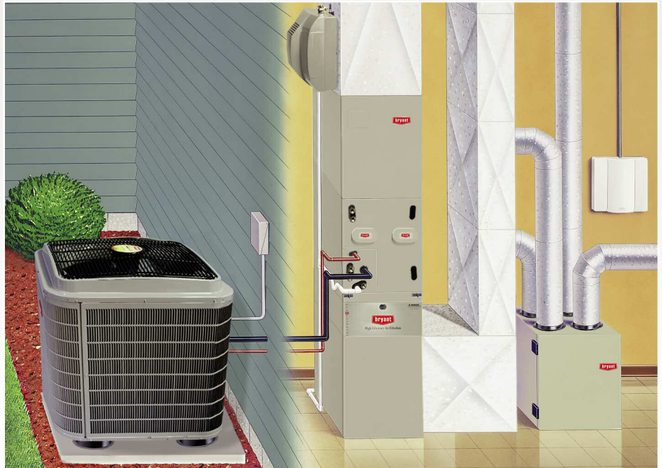
Heat Pump and Fan Coil System

DuraTech™ coil protection reduces the threat of formicary corrosion caused by typical household corrosives.