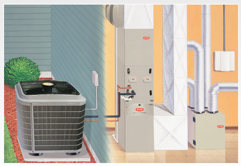
Heat Pump and Fan Coil System